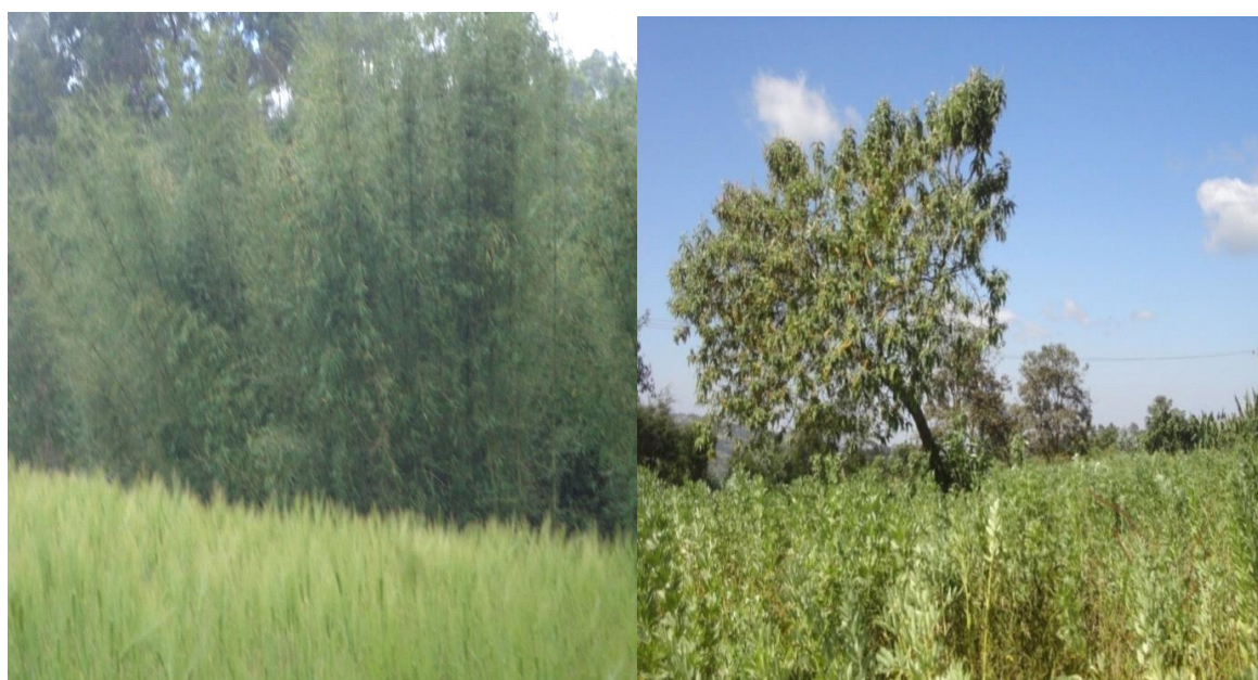
Fig 6. Bamboo lot ( Yushania alpine ) at left and Vernonia amygdalina with faba bean at right.