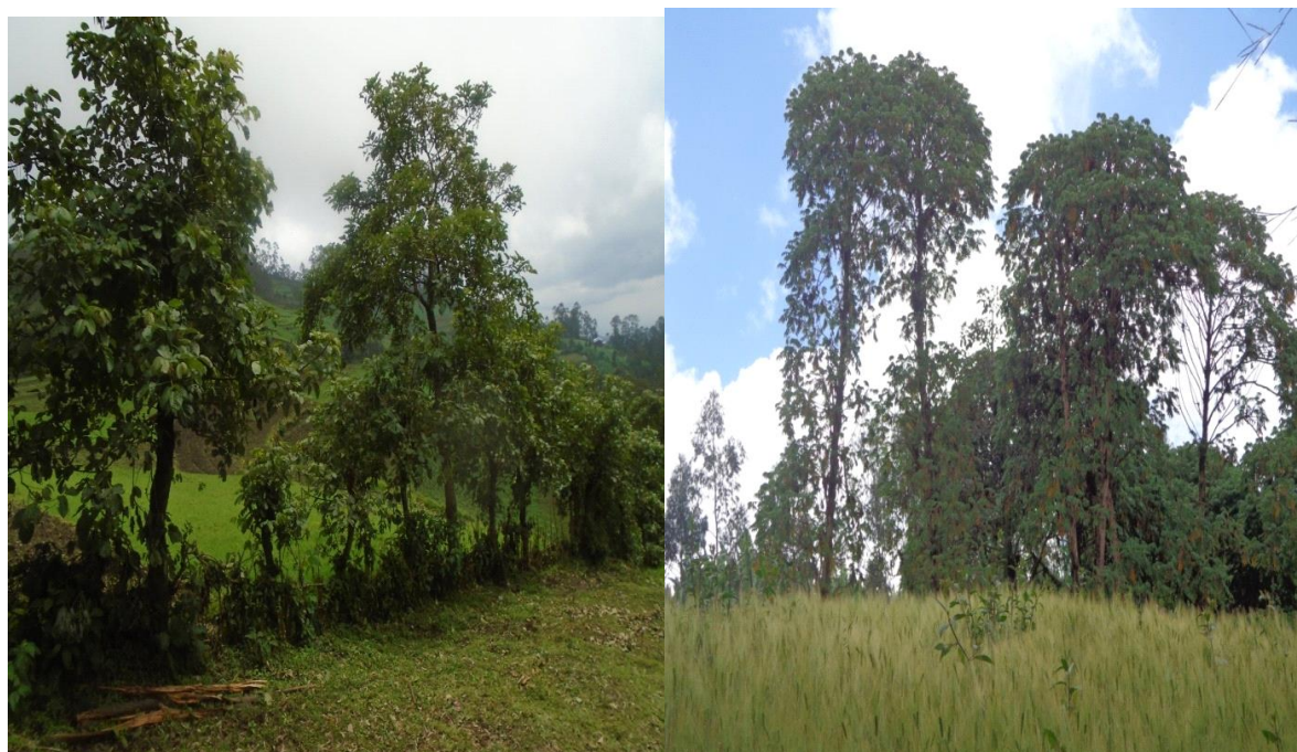
Figure 5. Erythrina brucei (left) and Hagenia abyssinica (right) as a boundary planting.