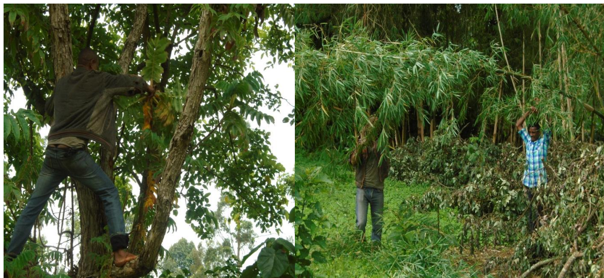
Figure 2. Collection of Hagenia abyssinica (Left) and Yushania alpina (Right) leaves from standing trees.