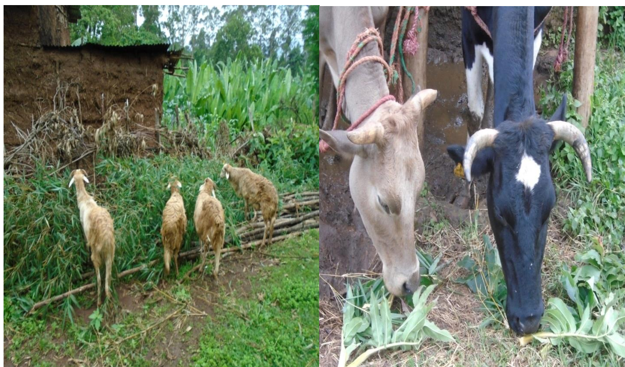
Figure 3. Sheep feed on Bamboo leaves and cows feed on Hagenia abyssinica leaves in the study area